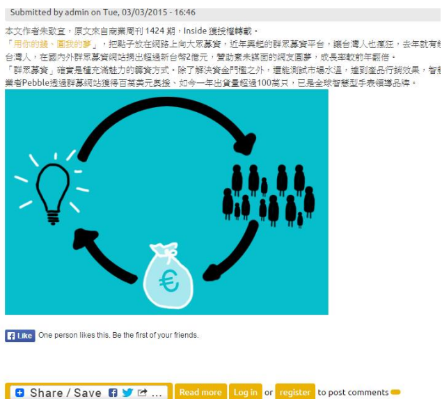
Figure 3. News of SMEs in EBCC [14]

The sharing space is designed for industrial designers in order to show their crafts/sketches, these designers may have a demonstration space.