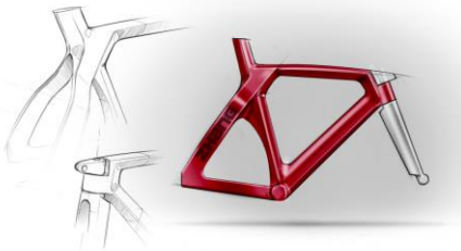
Figure 6. The Sketch of Bike Frame

Second, the Duck Image Company joins to prepare the sketches for candidates. An example of this process is shown in Figure 6. The selection process considers multiple attributes among five candidates; for example, outlook, strength, the time of 3D-printing (time to market), etc. At the same time, the bike company and the design company communicate mutually and intensively online via EBCC. The discussion content mainly focuses on the issues of progress and strength of this new product.