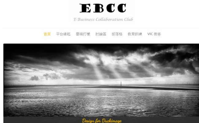
Figure 1. Portal Entrance of SMEs for EBCC [14]

This platform preserves the dialogue history among SMEs when they discuss the new product development. Real time messages with sketches, pictures or files could be intensively exchanged here. In addition, we also provide the service of cloud prototyping by 3D printers. We define this part as the collaborated knowledge, which is tacit.