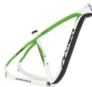
Figure 5. Bike Frame Example

We had collected about thirty registered members in EBCC, such that we can observe how they cooperate together by their explicit image (PR). We found that if a SME is good at PR by EBCC, then it is easy to get more supports/collaboration in EBCC. The PR here is simply defined as the tracking number of the specified SME in EBCC. This behavior is somewhat similar to the phenomena in Facebook.