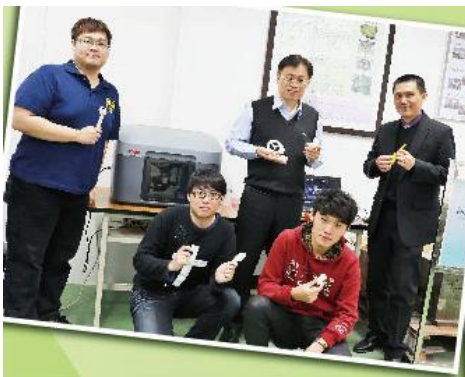
Figure 7. The Research Team and 3D Printer

Third, once the sketch is chosen, professors in Da-Yeh University receive the final sketch with dimensions online, and use the software: SOLIDWORKS[15] and ANSYS[16] to construct the 3D-model, and analyze the frame to see if it meets the European safety requirements. After it passes the requirements, professors separated the 3D frame model into many small parts for 3D-printing. The 3D printer and the research team are shown in Figure 7.