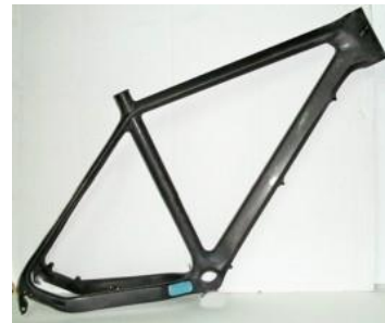
Figure 8 The Printed Bike Frame

To summarize, we evaluate the EBCC that has the following new features which facilitate the success of cloud prototyping for the bike company. First, the knowledge management system within EBCC is quite huge, which contains a series of steps: the knowledge collection, the reorganization, the dispersion, the application, the renewal, the creation of values, and so on. Taking the bike company as an example, we may collect the bike design cases via internet: these data include the image, the writing or the multimedia. And these data are stored in the interior databases for reference by the registered members.