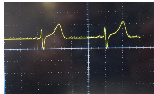
Figure 2. Resultant electrocardiographic signal.

There is a large number of circuits that measure the electrocardiographic signal. One of the goals of the DelphiCare was to obtain a system that was low cost and had a large portability in comparison with similar systems. Finally, a circuit that obtains a signal from the heart was chosen and built. As it is shown in the block diagram in Figure 1, the signal is obtained through a series of electrodes connected to the chest of the user. After collecting the said signal, it is then subjected to several amplifications and filters, so it becomes easier to be identified and to work with before reaching the analog port of the Arduino board and finally being transferred to the mobile app. The resultant signal is shown in Figure 2.