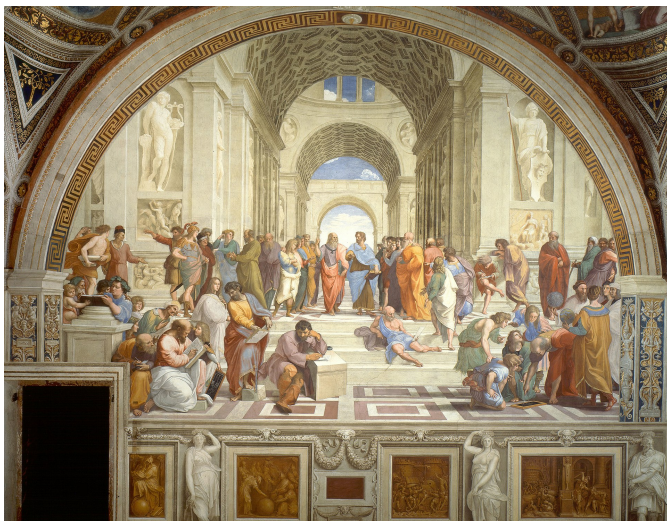
Figure 1. Raphael's celebrated fresco the School of Athens on the wall of Apostolic Palace in Vatican City.

practice and qualifications with others might put their goodwill in danger. Even institutions of the same status can have severe reluctance in joining such a union [4]. For instance, Imperial College London and University College London, two world-renowned universities from England, initiated a merger in a bid to form a large university capable of attracting twice the research fund universities such as Oxford or Cambridge can allure [5]. Although the alliance could help them achieve many benefits, it did not come through due to opposition from management and students of both universities [6].