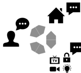
Figure 4: The human user can interact (via CE) directly with all devices and with devices via the concierge

Whilst the former would be sufficient to enable purely human-machine interaction, one of the goals of this work is to enable the human to passively observe the interaction of the devices in the home in order to help the human gain awareness of how the system is behaving. This will better enable the human user to see normal behavior over time and therefore prepare them for understanding anomalous situations when they arise.