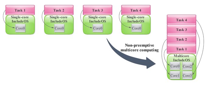
Figure 1. Multicore IncludeOS non-preemptive task management approach.

In addition, the non-preemptive task management provides energy efficiency by reducing memory consumption and avoid context switching. The preemptive scheduling requires a bigger stack size in order to store the state of switched tasks in memory. Hence, an operating system requires more memory for a program stack whenever the number of cores increases. On the other hand, by employing non-preemptive task management