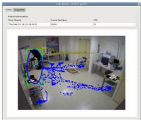
Figure 2. Multi-sensor activity recognition system screen. Rectangle envelope highlights the detection of a person in the scene. Blue dots represent previous positions of the detected person in the scene.

The vision component has been developed using a modular vision platform locally developed that allows the test of different algorithms for each step of the computer vision chain (e.g., video acquisition, image segmentation, physical objects detection, physical objects tracking, actor identification, and actor events detection). The vision component extracts the objects to track from the current frame using an extension of the Gaussian Mixture Model algorithm for background subtraction [26]. People tracking is performed by a multi-feature tracking algorithm presented in [20], using the following features: 2D size, 3D displacement, color histogram, and dominant color. Fig. 2 shows an example of the vision component output. Rectangle envelope highlights the detection of a person in the scene. Blue dots represent previous positions of the detected person in the scene.