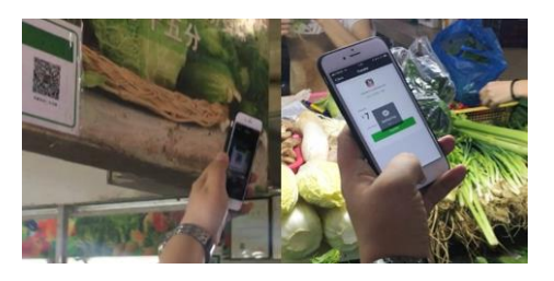
Figure 1. User scanning merchant's QR code for payment

In addition, 2 participants (20%) felt the physical environment could be a risk for mobile payment users. Since surveillance cameras are installed in public places, users cannot avoid being recorded every time they input their password. U9 gave a detailed description of the situation: "There are surveillance cameras in supermarkets or banks. When I use mobile payment to pay in these places, I input my passwords in a hurry sometimes. The charging process needs to be quick, so I am not able to use my hand to cover it, or my phone screen is too large to cover. My password would be easy to record."