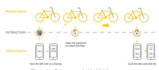
Figure 4. Payment settled in Mobike system