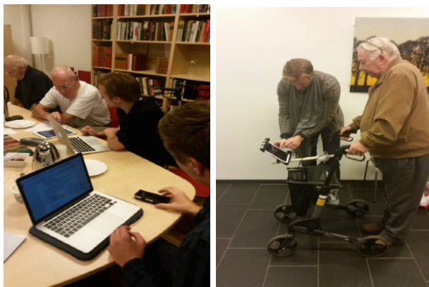
Figure 2. SmartWalker: design and testing. Photos from [34].

The two student teams consisted of four second year undergraduate students each, and were supervised by a PhD student whose research relates to elderly living in a smart house. Thus, both projects address design for and with elderly, see [33] and [34] (both projects were delivered in Norwegian, but one group also posted the abstract in English of the paper that they are writing for HCII 2015 conference [35]). The latter project, see Fig. 2, developed a high fidelity interactive prototype utilizing frequency based technology (iBeacons) that helps elderly with cognitive difficulties to navigate complex buildings indoor.