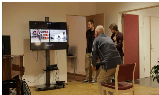
Figure 3: An exercise system that enables correction of movements during the exercise session. Photo from [33].

Even though these two groups have achieved very nice results, they were certainly not the only ones that pursued the goal to be innovative and creative. Different ways in which this focus on creative thinking and innovation affected the work of the project teams is discussed in the next section.