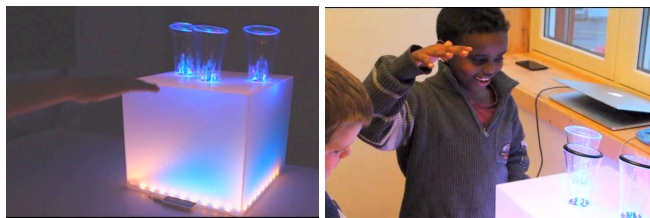
Figure 4. The water fountain project that uses LEAP motion to control the level of water.

water fountain with LED lights, was fun to play with, had a pleasing, very soft sound of water and was nice to look at, see Fig. 4 and [38].