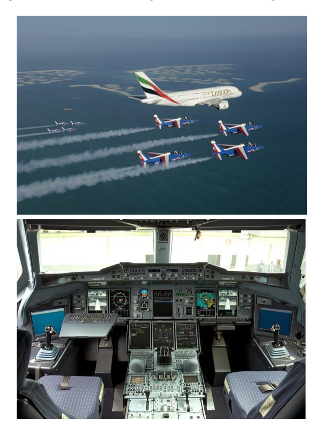
Figure 3- The automated Airbus A380 cockpit totally dependent on electricity

adequately addressing the problem of electrical fire in flight and is trying to deal recklessly [13]. The high rate of procedural error associated with cognitive errors, in the automation age, suggests that the projects in aviation have ergonomic flaws. In addiction, is has been related that the current generation of jet transport aircraft, used on airlines, like the Airbus A320, A330, A340, Boeing B777, MD11 and the new A380 (see Fig. 3), that are virtually "not flyable" without electricity. We can mention an older generation, such as the Douglas DC9 and the Boeing 737.