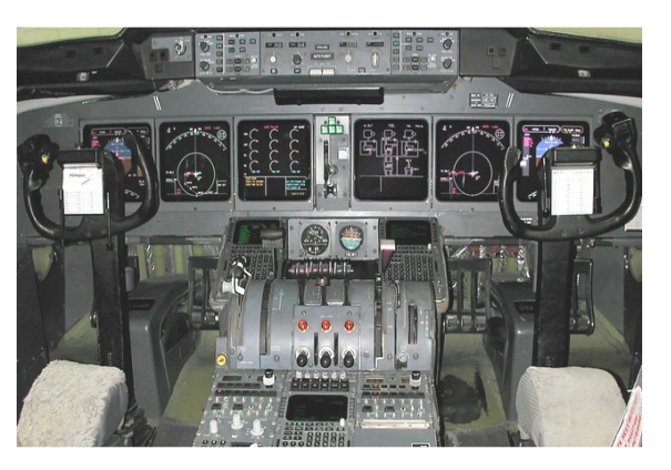
Figure 4 - The cockpit of the old Douglas MD-11

Another factor in pushing the pilots that causes emotional fatigue and stress is the reduction of the cockpit crew to just two. The next generation of large transport planes four engines (600 passengers) shows a relatively complex operation and has only two humans in the cockpit. The flight operation is performed by these two pilots, including emergency procedures, which should be monitored or rechecked. This is only possible in a three-crew cockpit or cockpit of a very simple operation. According to the FAA, the only cockpit with two pilots that meets these criteria is the cabin of the old DC9-30 and the MD11 series (see Fig. 4). The current generation of aircraft from Boeing and Airbus do not fit these criteria, particularly with respect to engine fire during the flight and in-flight electrical fire.